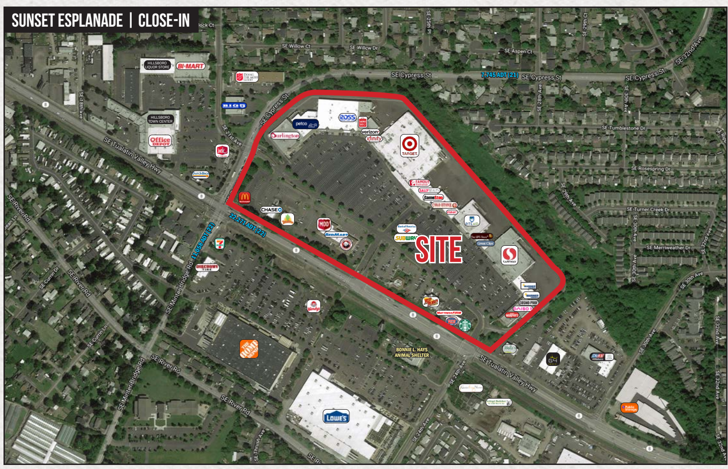
The information herein has been obtained from sources we deem reliable. We do not, however, guarantee its accuracy. All information should be verified prior to purchase/leasing. View the Real Estate Agency Pamphlet by visiting our website, <a href="https://www.cra-nw.com/home/agency-disclosure.html">www.cra-nw.com/home/agency-disclosure.html</a>. CRA PRINTS WITH 30% POST-CONSUMER, RECYCLED-CONTENT MATERIAL.